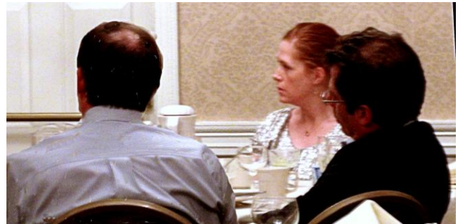
Three Rotarian thinking deeply about contract law

Even if there is no agreement, there is an ethical obligation