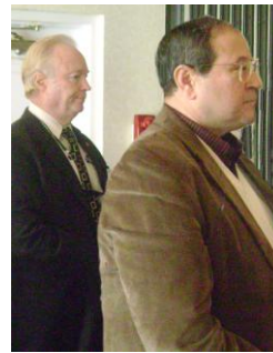
Rotarians in the Lion's Den