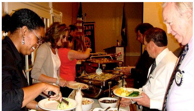
The Club Working the Chow Line