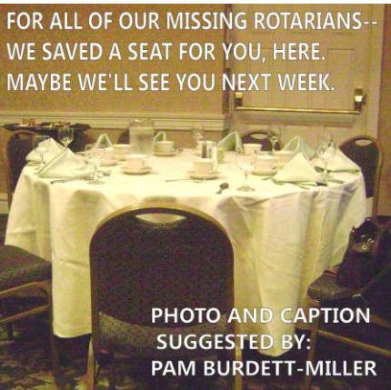
FOR ALL OF OUR MISSING ROTARIANS-- WE SAVED A SEAT FOR YOU, HERE. MAYBE WE'LL SEE YOU NEXT WEEK.